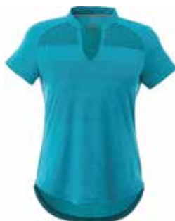
W-ANTERO SHORT SLEEVE POLO W 96703 (XS - 2XL)