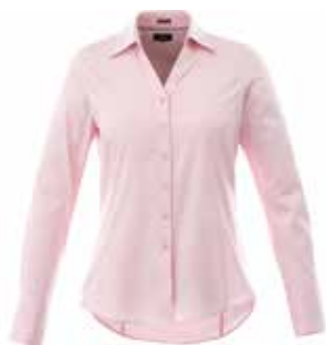
W-CROMWELL LONG SLEEVE SHIRT W 97309 (XS - 2XL)