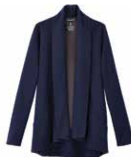
W-EQUINOX KNIT BLAZER W 98613 (XS - 3XL)