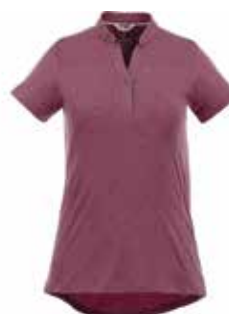
W-CONCORD SHORT SLEEVE POLO W 96611 (XS - 3XL)