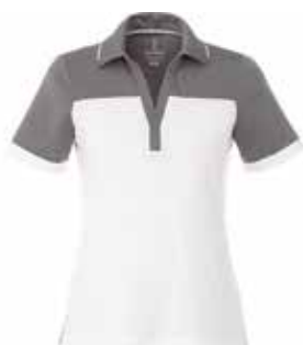
W-MACK SHORT SLEEVE POLO W 96308 (XS - 3XL)